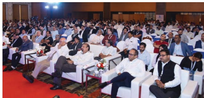
A view of Participants