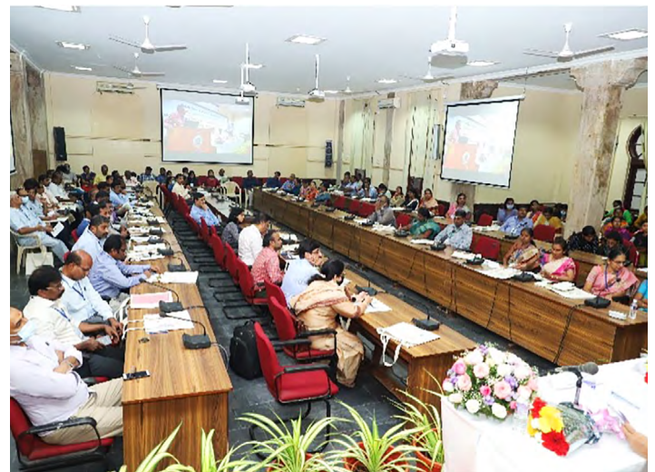
Participants at the workshop in Coimbatore (November 29, 2022).