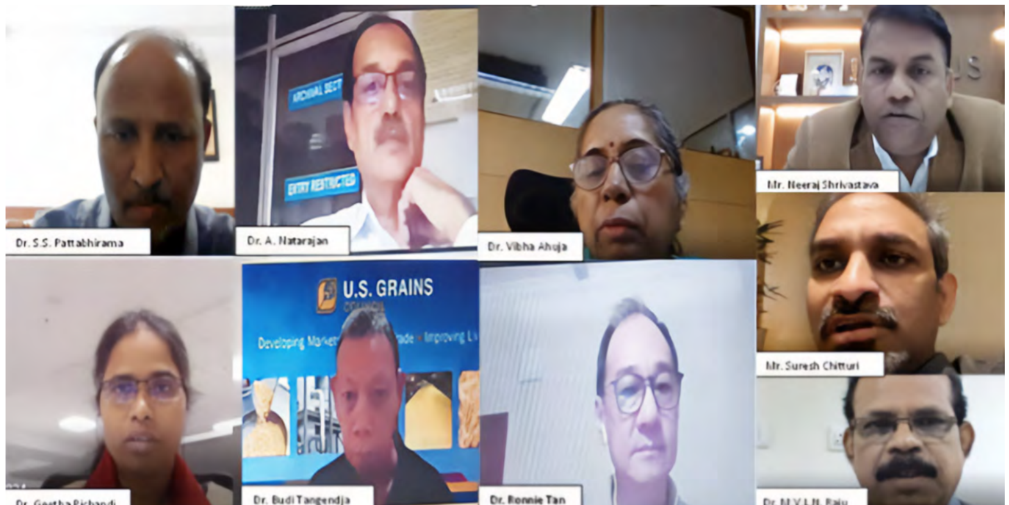
Speakers at the webinar on DDGS for Animal Feed: Opportunities and Challenges (November 11, 2022).

Access a recording of the webinar at: https://www.youtube.com/watch?v=iRmx8z1NfQw