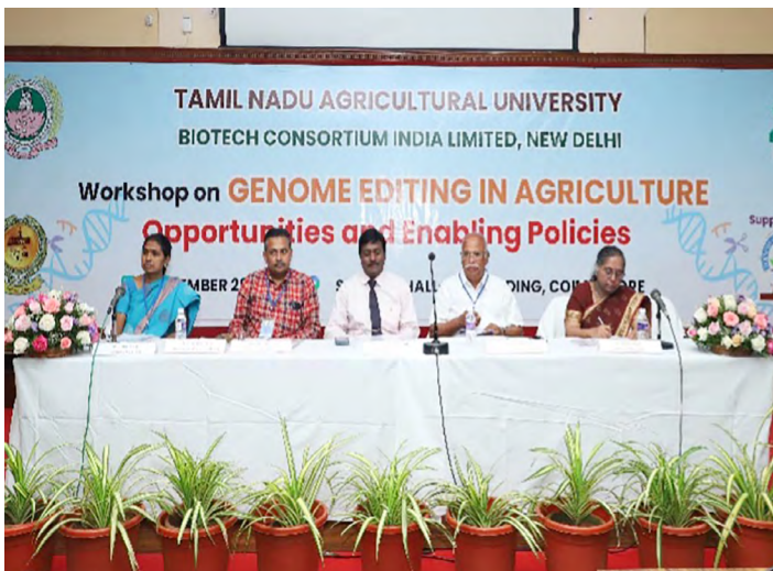
Speakers at the workshop in Coimbatore (November 29, 2022).

Approximately 130 participants from universities and research institutions in Tamil Nadu, as well as representatives from the Tamil Nadu Department of Agriculture and industry, attended the workshop.