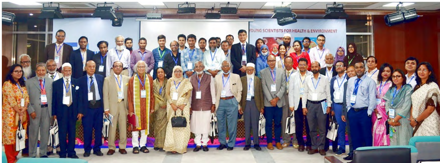
Eminent scientists, academy fellows, and some participants after the 5 th Young Scientist Congress (November 25, 2022).

Bangladesh is a country with a relatively large proportion of young people. Blessed with great potential, this young generation has been leading the country's development. The government of Bangladesh has felt the importance of equipping this young generation with frontline science, technology, and innovation (STI) tools so that they can better serve society and prepare themselves to face the challenges in the future. Realizing the importance of attracting the best young minds to science, the Bangladesh Academy of Sciences (BAS) has initiated a series of Young Scientist Congresses, where senior scientists and experts from home and abroad share their knowledge and experience with their younger counterparts. The fifth congress of the series was designed to highlight research areas addressing some of the major challenges faced by the country, especially in the health and environment sectors.