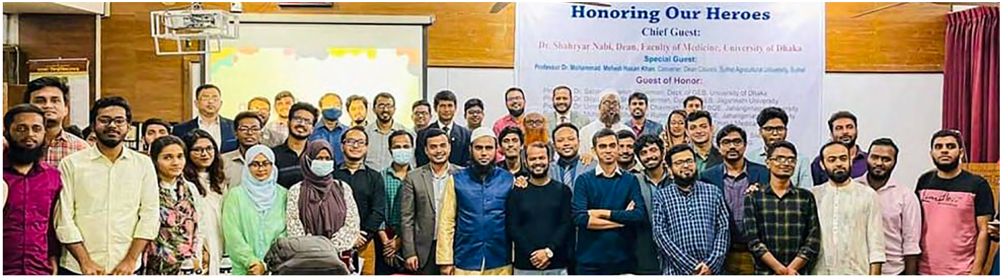
Guests and awardees at the Honoring Our Heroes event (November 26, 2022).