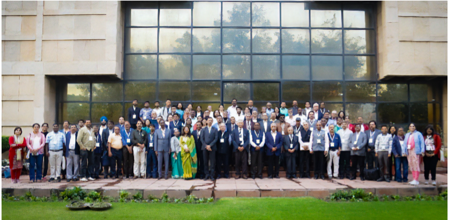
Group photo of participants at the National Consultation Meeting (28 November 2023).