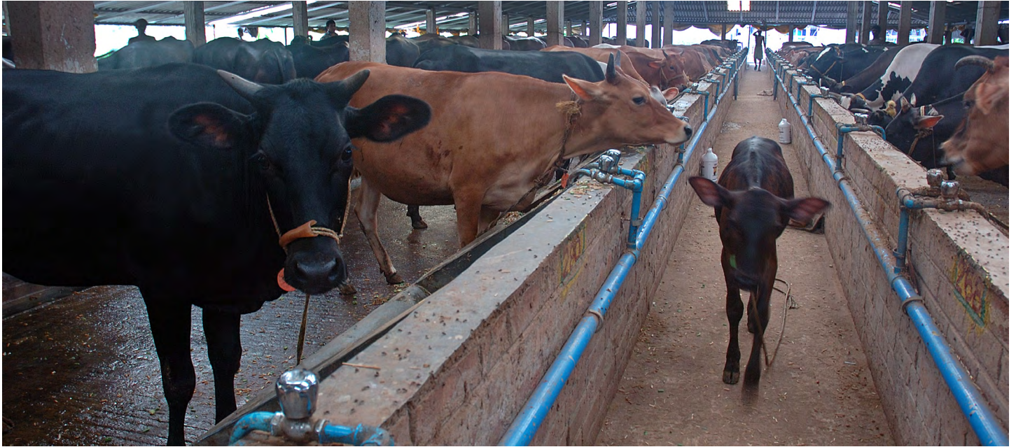
Dairy farm in West Bengal, India