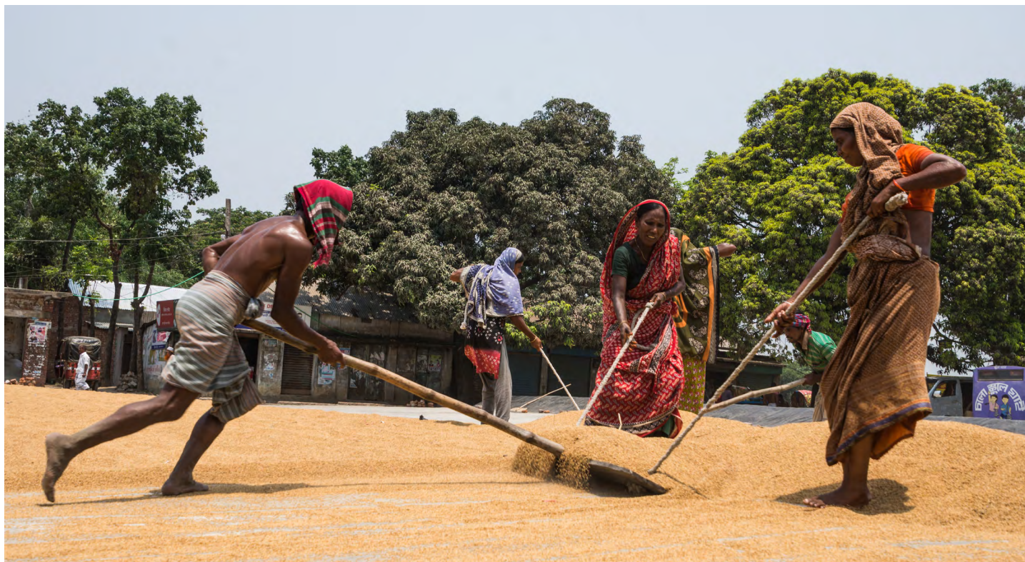
Workers processing paddy rice in Bangladesh

To encourage written discourse on topics related to biosafety and biotechnology among the younger generation, the SABP Newsletter dedicates space in select issues to spotlight pieces written by students residing in South Asia. Since articles with the “Student Showcase” tag are meant to reflect the actual views and capabilities of the author(s), they are not revised for content and only lightly edited to conform with the newsletter’s style guide.