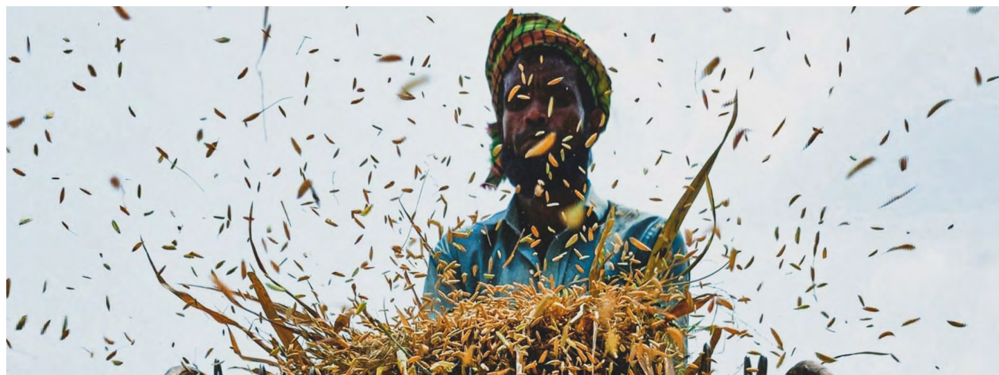
Farmer harvesting rice in Bangladesh