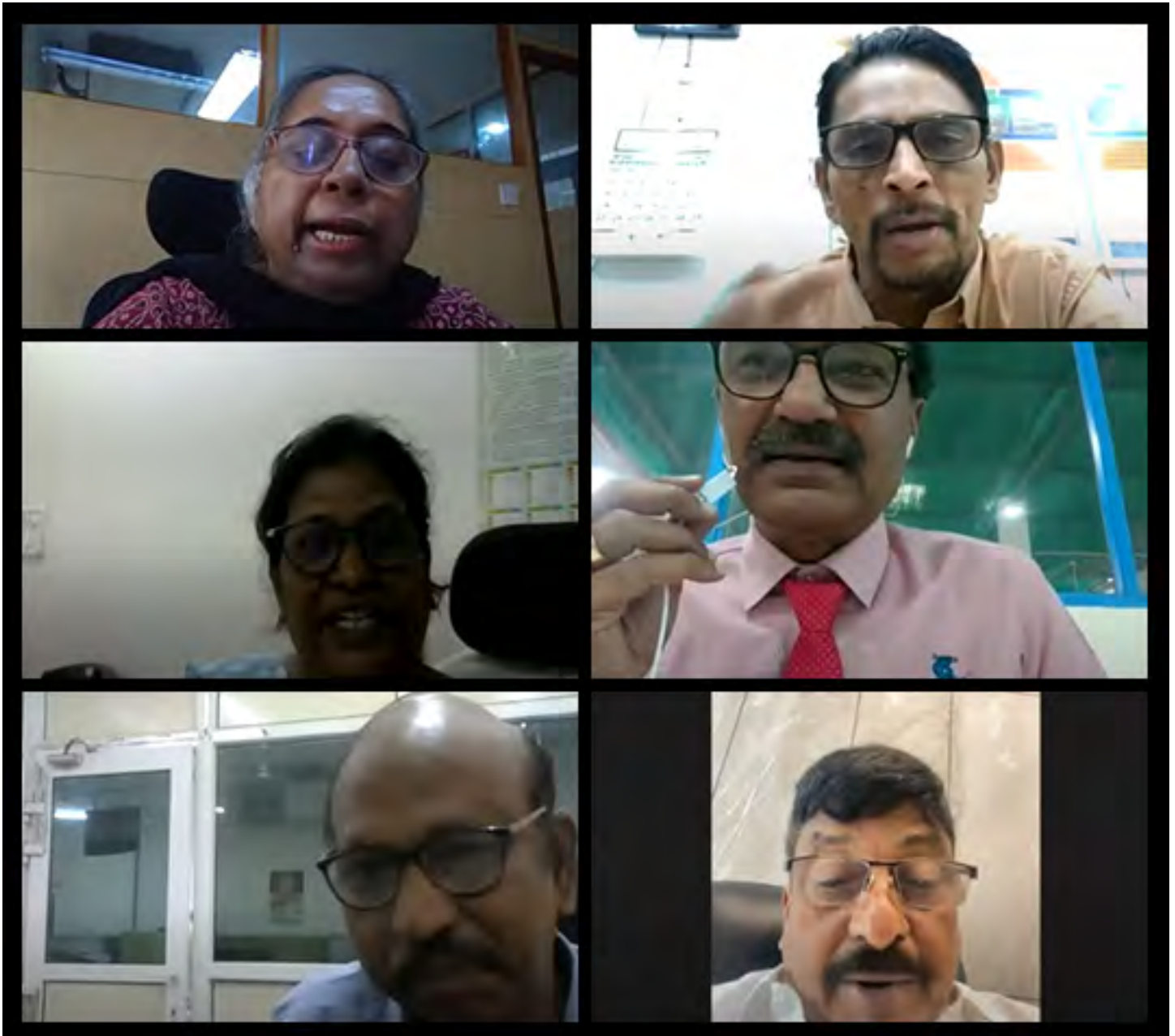
Speakers at the webinar on "GM Crops and Their Derivatives for the Aqua Sector" (7 July 2023).

Dr. Ahuja highlighted the development of GM crops for desirable traits, such as insect resistance, disease resistance, and herbicide tolerance, which have contributed to increased yields.