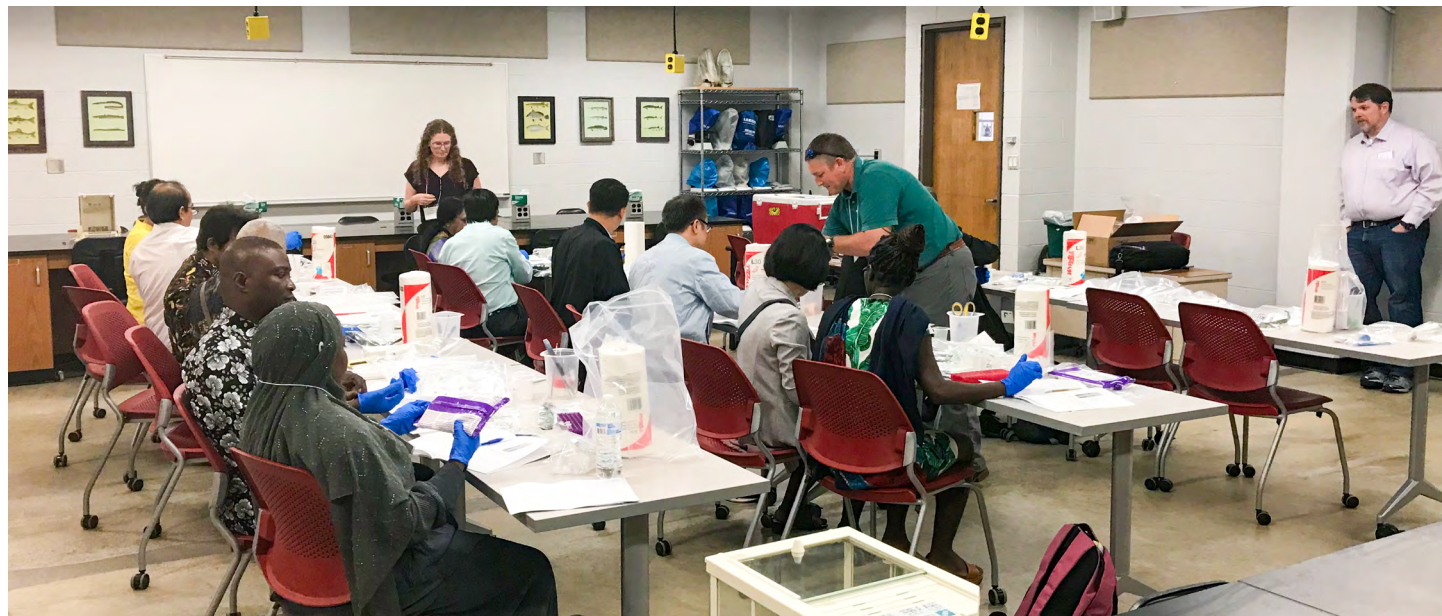
Participants and faculty during a laboratory session at the workshop (29 June 2023).

digital PCR for copy number data, etc., which are required for regulatory assessment for deregulation of GM events.