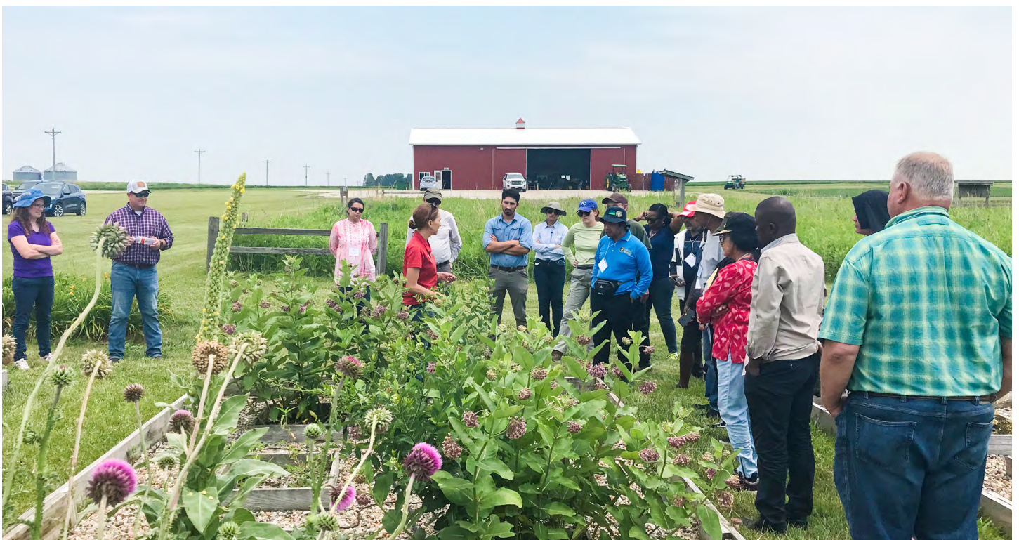
Participants and faculty during a field session at the workshop (27 June 2023).

A visit to the regulatory division of Corteva Center at Des Moines gave useful insights on protocols for ecological safety assessment, event characterization, protein toxin characteristics, allergenic information,