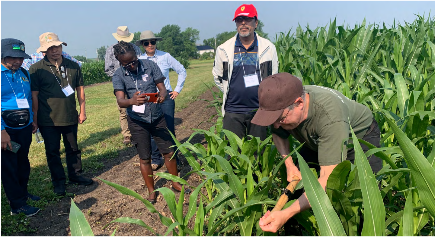
Participants and faculty during a field session at the workshop (27 June 2023).

region. Field assessment of the diversity of NTOs was demonstrated practically in a specially raised GM maize field with a non-GM control field. A field team from Bayer demonstrated the monitoring of NTO abundance by setting up pitfall and yellow sticky traps, followed by lab examination and identification of the NTOs trapped. Inferences based on results were discussed. The key learning was that field studies are relatively less reproducible and less reliable for decision-making in comparison to lab assessments.