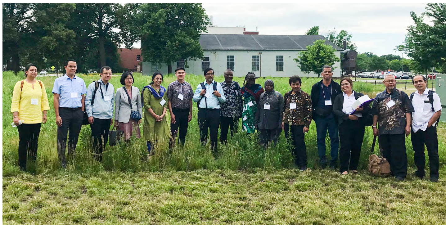
Participants and faculty at the Environmental Risk Assessment (ERA) Workshop on Non-Target Organism Testing (26 June 2023)