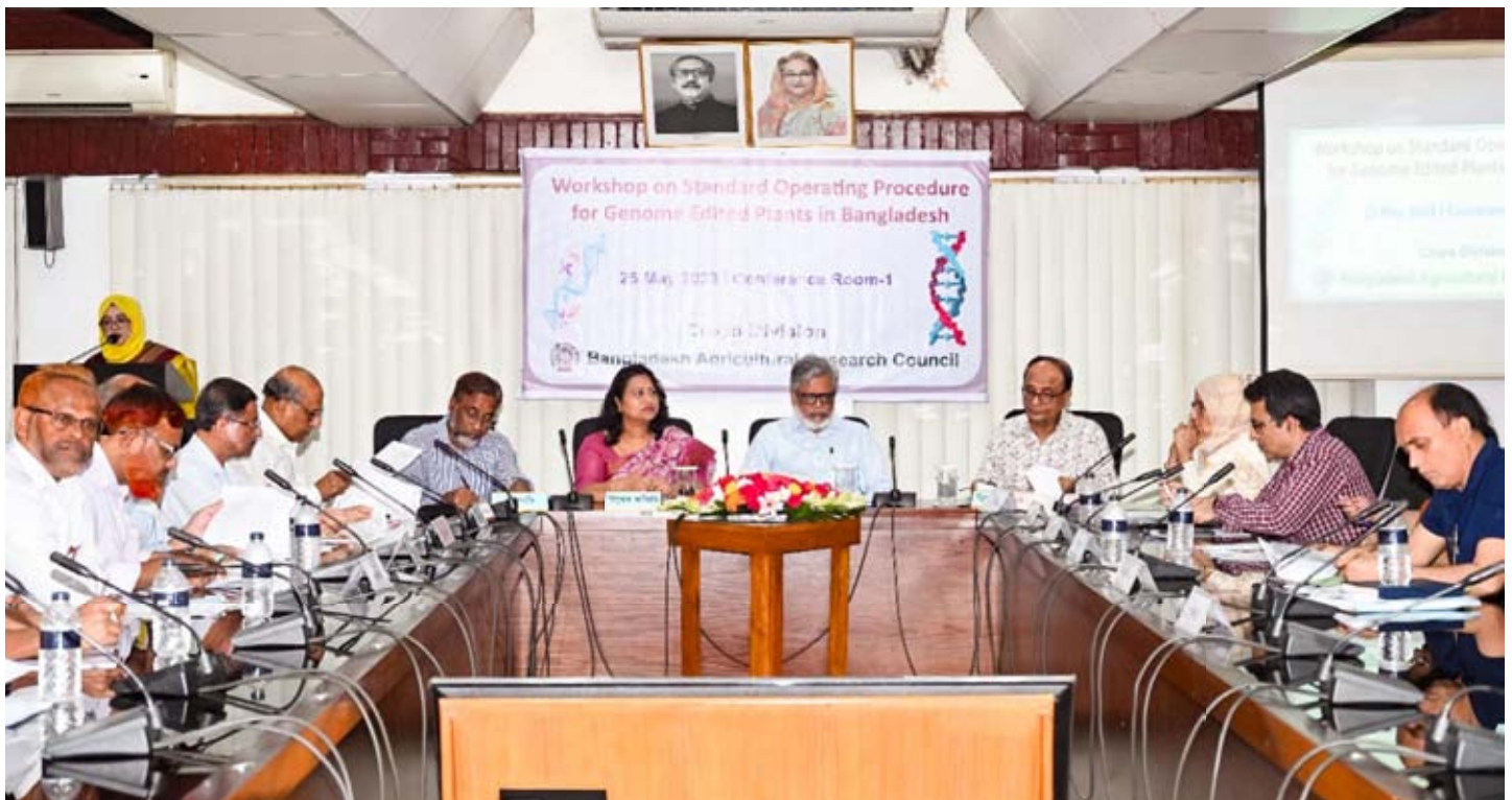
Guests and participants at the Workshop on Standard Operating Procedure (SOP) for Genome Edited Plants in Bangladesh (25 May 2023).