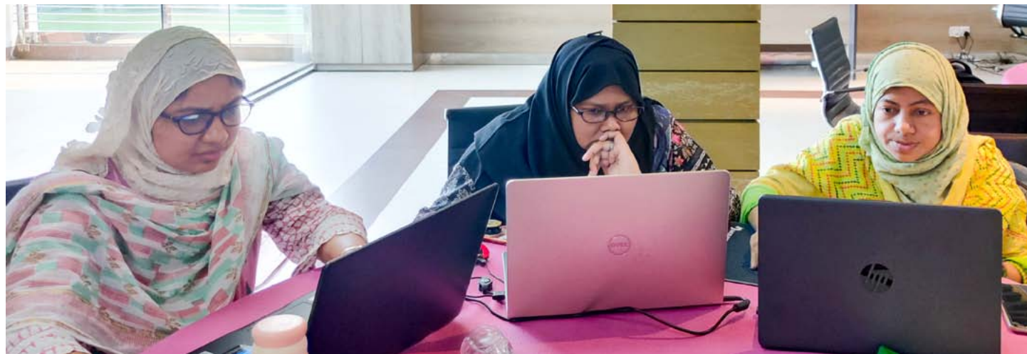
Workshop attendees participating in one of the exercises (13 October 2023).