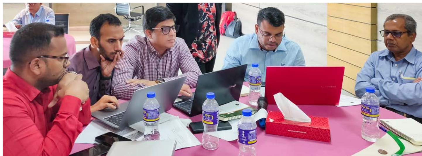
Workshop attendees participating in one of the exercises (13 October 2023).

Exercises on biosafety concepts and risk assessment tools were a very significant part of the workshop. Participants were able to complete five exercises related to ERA for GE plants.