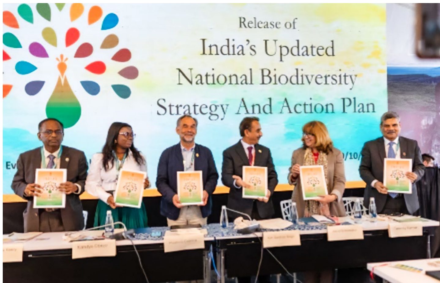
Speakers and guests at the event marking the release of India's Updated National Biodiversity Strategy and Action Plan in Cali, Colombia (30 October 2024)