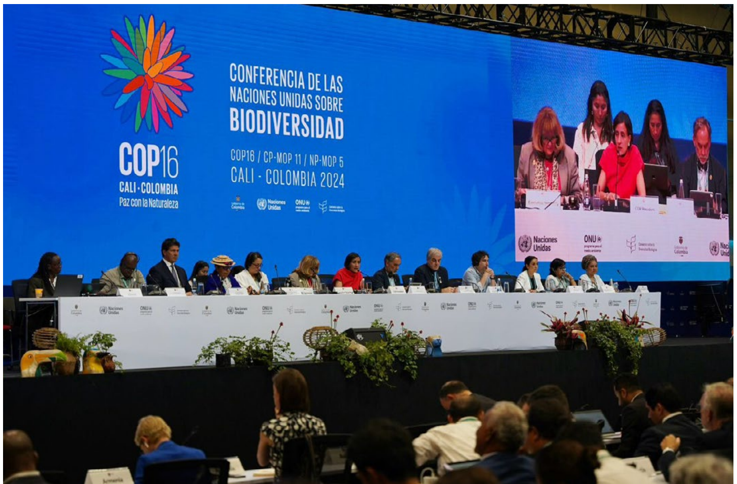
16 th Meeting of the Conference of the Parties (COP 16) to the Convention on Biological Diversity (CBD) Plenary Meeting in Cali, Colombia (30 October 2024).