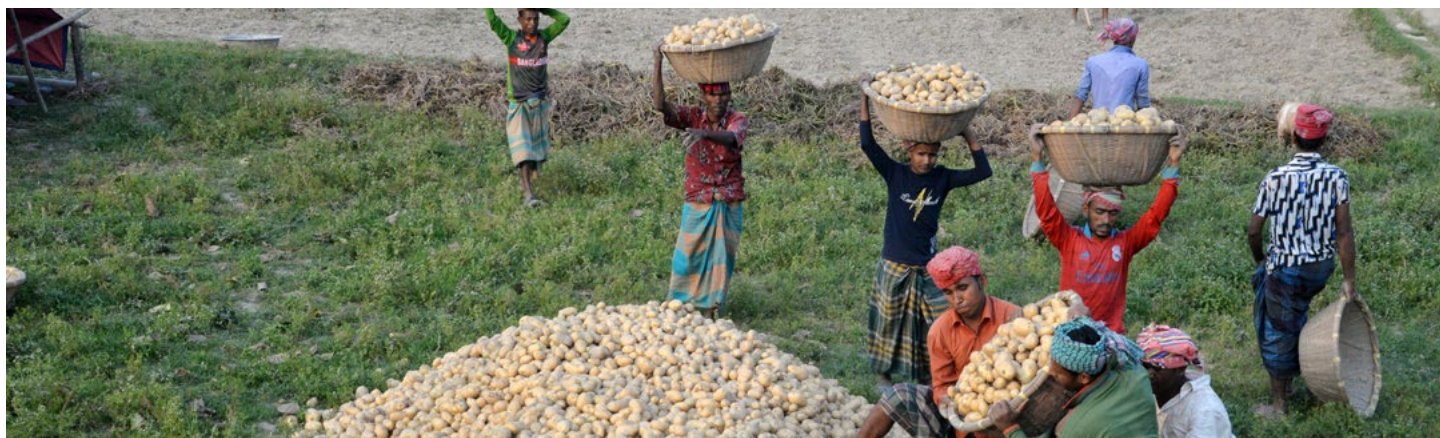
Potato farmers in Dhaka, Bangladesh (9 March 2021).

The research project "Use and handling practices of pesticides used in the cultivation of high yielding potato varieties in Bangladesh" was funded by the Agriculture & Food Systems Institute (BRBGP-05-2019).