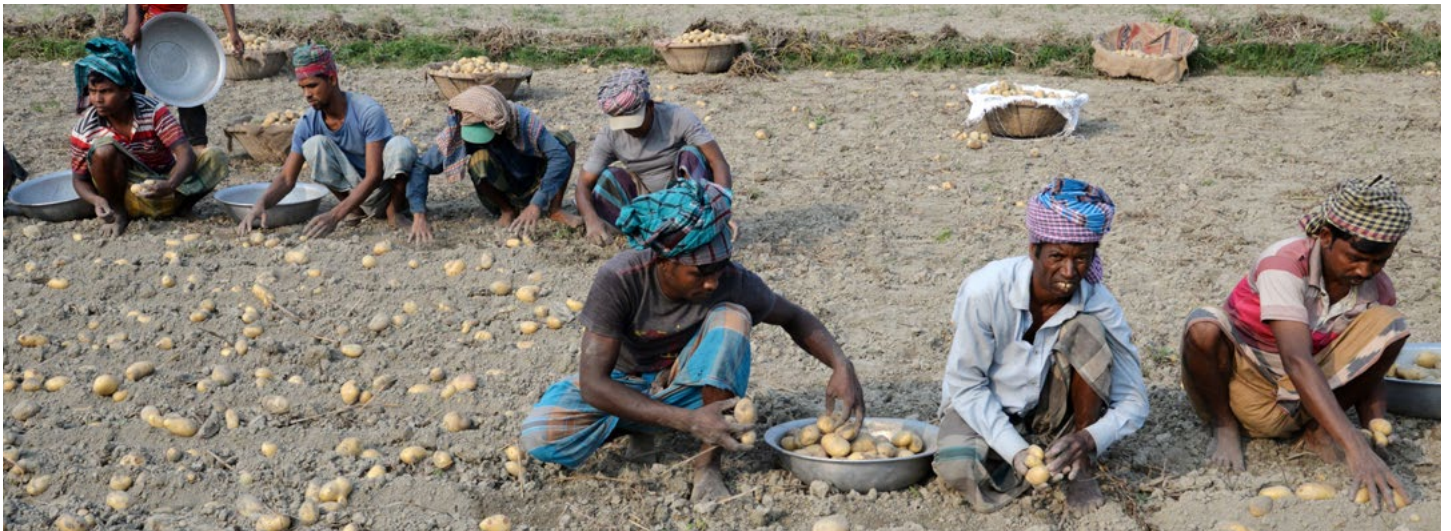
Potato farmers in Dhaka, Bangladesh (9 March 2021).