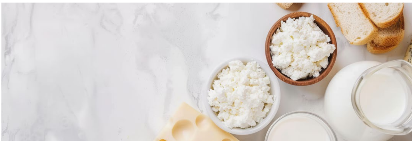
Products of classical microbial biotechnology, such as yogurt, bread, and cheese.

https://www.aphis.usda.gov/sites/default/files/brs-microbe-permit-guide-revised-draft.pdf