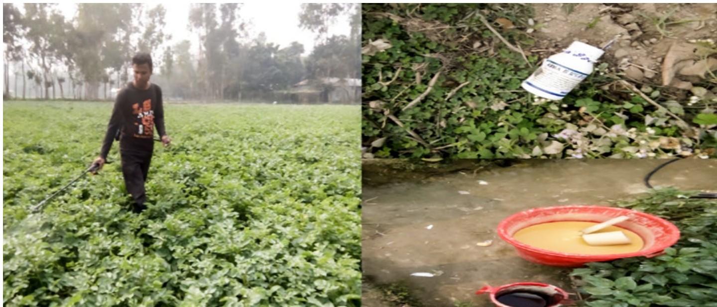
Photos showing pesticide use without personal protective equipment (left) and improper disposal of pesticide containers (right) at a potato farm in Bangladesh.

than five times in a cropping season. This widespread use of pesticides is alarming because of the effects on biodiversity, the environment, and health. Degradation of soil quality and, hence, reduced productivity of agroecosystems owing to the use of inorganic fertilizers is also well reported.