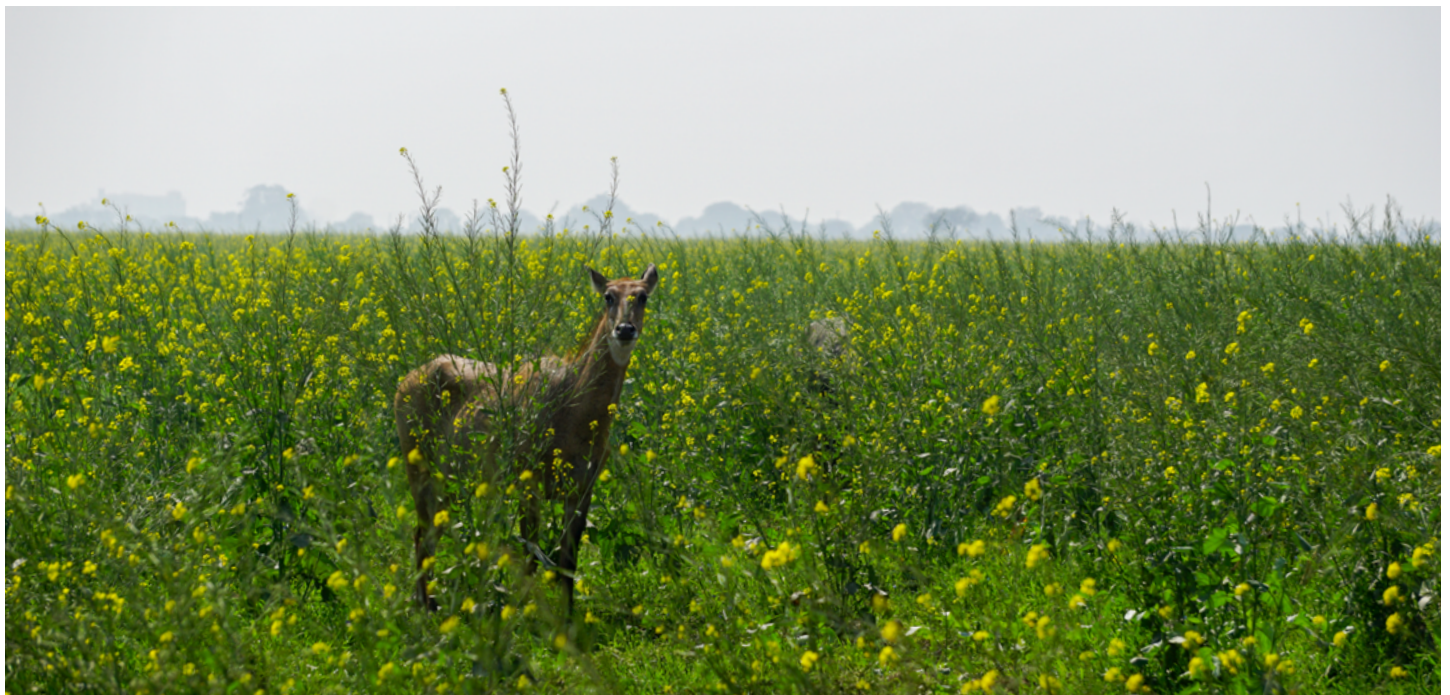
Nilgai in mustard field in India

Digital sequence information (DSI) on genetic resources is a placeholder term being used for data obtained from dematerialization of genetic resources, such as genetic sequence data.