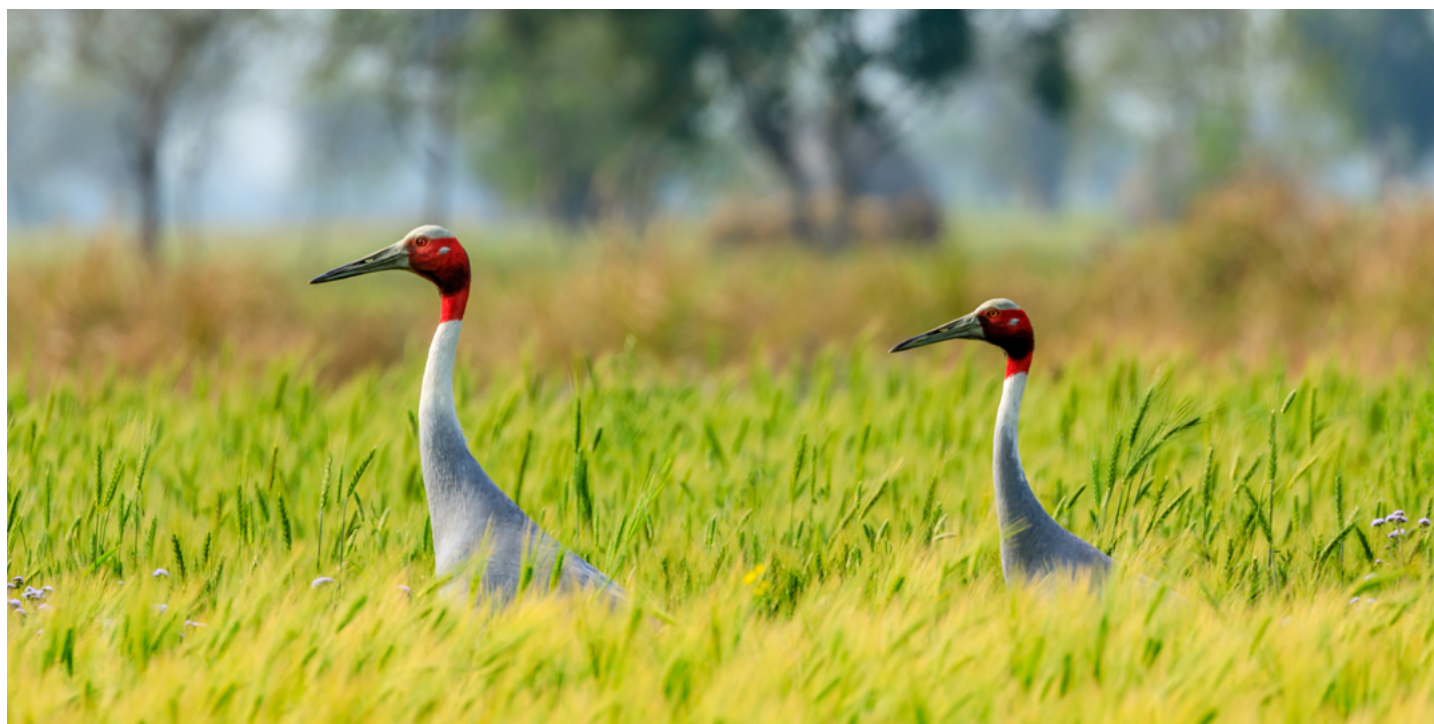
A pair of cranes walking through a wheat field in India